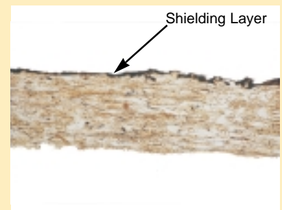
Microscopic cross section of graphite printed linerboard

Per ESD Handbook TR 20.20 paragraph 5.4.3.3.1 Returnable and Reusable Packaging "In some situations, packaging may be designed for reuse [and] may be reused numerous times. The initial cost of these packages may be relatively expensive. However, if the appropriate collection and recycling system is used, the container may be the least expensive choice over time."