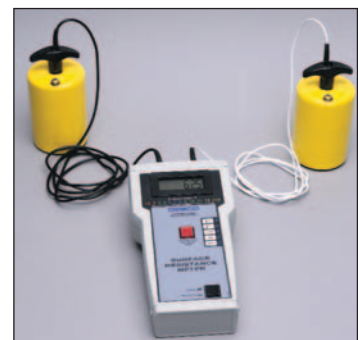
Figure 5: Surface resistance meter