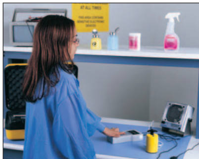
Figure 6: ESD mat with test kit

Most companies will have workers test their wrist straps while being worn daily. Per ESD-S1.1, paragraph 6.1.3, Frequency of Functional Testing, "the wrist strap system should be tested daily to ensure proper electrical value." However, two important wrist strap test