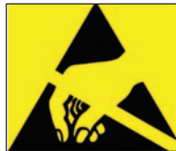
Figure 2: The ESD susceptibility symbol

ESD Susceptible Items should be clearly identified and handled only in an ESD Protected Area. The ESD susceptibility symbol (see Figure 2) exists to do this (Ref: S20.20, Paragraphs 6.2.3.1 & 6.2.5.1). However, many companies find that it is more cost effective to consider all electronic components and sub-assemblies containing electronic components as ESD sensitive, requiring that ESD precautions be followed when handling. In addition, employees are to be grounded and follow all ESD control procedures while working at an ESD-protected workstation, regardless of what they are working on (even nuts & bolts!). If running different systems dependent upon identifying ESD susceptible items, then periodic verification of this should occur at least quarterly.