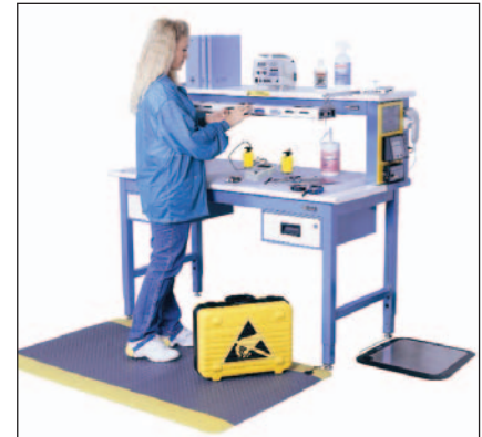
Figure 4: ESD workstation

grounding system is dependent upon the electrical outlets being wired properly. This can be easily checked with an AC outlet analyzer. A typical company would verify their electrical receptacles quarterly.