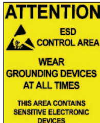
Figure 1: ESD protected area warning sign

A typical periodic testing program would include a quarterly check that the ESD Protected Area is clearly identified using signs (see Figure 1) & aisle tape. (Ref: S20.20, Paragraph 6.2.3.1)